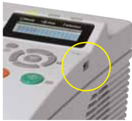
Print your files directly from memory using the convenient USB Host Interface